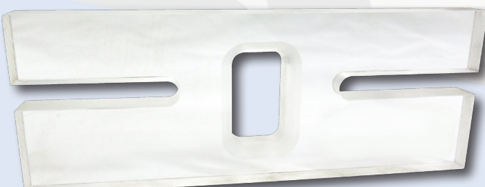
Radius Inlet Port Plate Fits Fuelie 492 Heads (1.080" x 1.900")